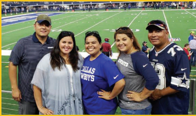
Bryan's House staff and volunteers enjoying a Dallas Cowboys' game compliments of the Woodall Foundation

On any given Sunday, the Dallas Cowboys are the hottest ticket in town. Unfortunately, the average family can't afford to attend a game in person. The Woodall Foundation was fortunate enough to be able to donate 4 game tickets plus parking to some very deserving staff and volunteers at Bryan's House. The outing was a complete success and even included a Cowboys victory. Please visit www.woodallfoundation.com to donate.