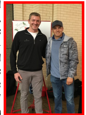
Adam Carriker and Dallas PGA superstar Jordan Spieth ring the bell

A special thanks to all who came by in support.