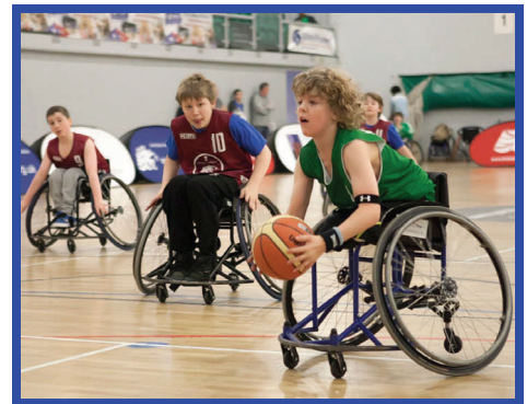
RISE Adaptive Sports basketball event

Gardens is set to begin construction of its snake and reptile exhibit later this fall. The Children's Craniofacial Association was proud to report that a record number of families were able to attend this year's annual retreat. RISE Adaptive Sports has been putting its new athletic equipment to good use. And the Heroes for Children Foundation was able to provide more children in the hospital with laptops this year.