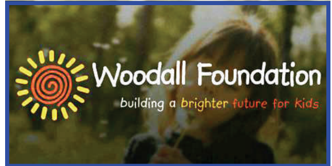
The new Woodall Foundation homepage