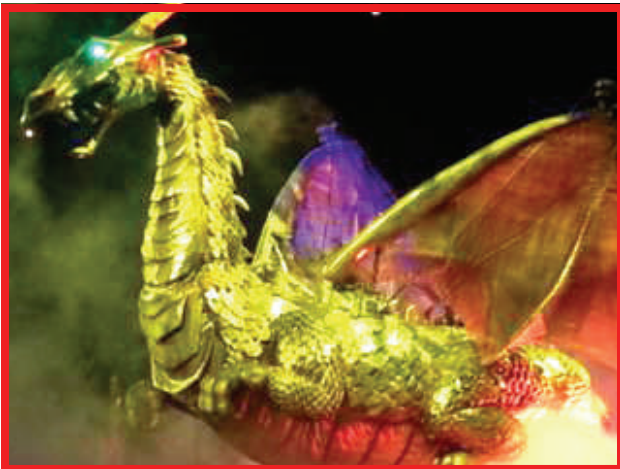
The Dragon circus performance at American Airlines Center