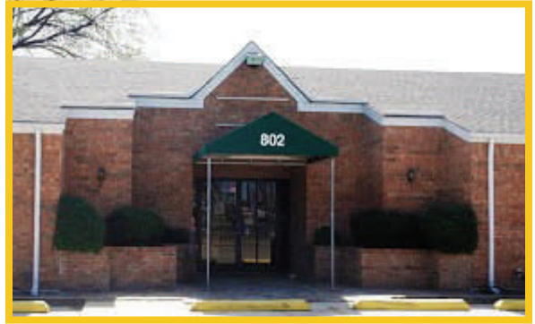
Bryan's House facility on South Beckley in Dallas

Last December the Woodall Foundation awarded $80,000 in grants to local organizations in the Dallas area that are dedicated to improving the lives of children and their families. We have received some updates from those beneficiaries and are happy to share the news with you.