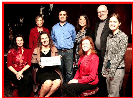
The staff and board members from the Texas Discovery Gardens