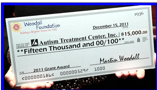
Donation presented to the