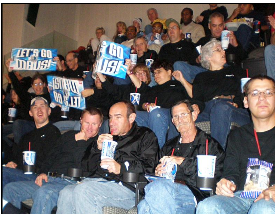
TK Ranch show their Mavericks spirit while enjoying refreshments provided by the Woodall Foundation

The TK Ranch is a fully functioning community that assists the needs of autistic individuals by providing them with treatment, education and opportunity through a structured living environment. In addition to the therapy and training received at the ranch, each resident has certain responsibilities that are crucial to the daily operations of the community.