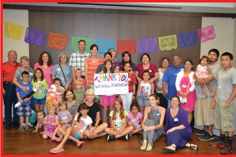
Campers and volunteers gather to thank Woodall Foundation on the last day of Camp Noogie

This year marked the 5th anniversary of the Cancer Support Community's Camp Noogie, a free weeklong camp for kids affected by cancer. Every year campers gather in the clubhouse to play, make friends and heal. Once again the Woodall Foundation was a proud sponsor of this wonderful program. The kids stream through the bright red door to craft and play games. But unlike at other camps, they also practice yoga, play with therapy dogs and do other activities that help develop coping and communication skills.