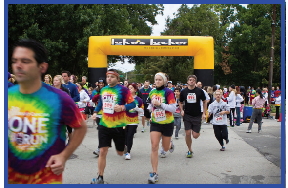
Runners leaving the starting line at the One Run.

Thanks to all these successful events. The Woodall Foundation beneficiaries can expect a prosperous year in 2014.