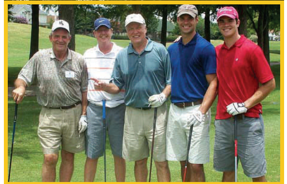
Golfers at the Bryan's House Open.