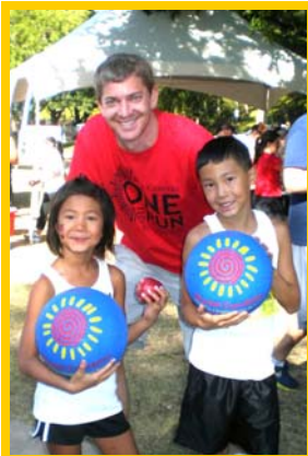
Dribble Dash Winners

The Cancer Support Community organized its inaugural ONE RUN to help raise money and build awareness for all cancer diagnosis. This event was held at Reverchon Park in Dallas and included a 5K Run, a 1K walk, and a children's 100 yard "Dribble Dash" sponsored by Woodall Foundation, where Kids raced while dribbling Woodall Foundation logo basketballs prior to the start of the 5K run. In total over 300 runners participated and over $75,000 was raised to help support those living in the North Texas community impacted by cancer.