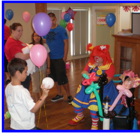
A clown entertained the kids and made balloon animals at Noggie Fest.