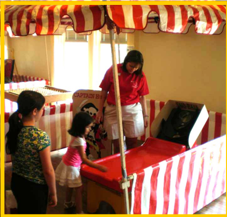
Volunteers organized carnival games for the kids at Noggie Fest.