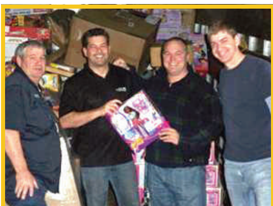
Woodall Foundation & Dallas Margarita Society volunteers loading the toys onto the truck.